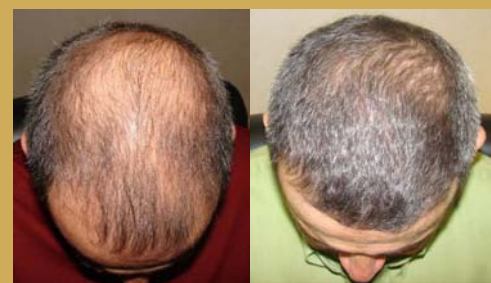
Patients before (left) and three months after (right) the use of Derma 5.